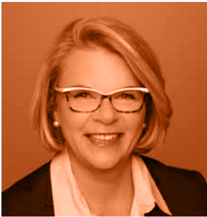
MARGARET SPELLINGS, 60 PRESIDENT, UNC SYSTEM CHAPEL HILL

UNC Health Care's proposed combination with Carolinas HealthCare System of Charlotte. He also is a director at DaVita and Express Scripts.