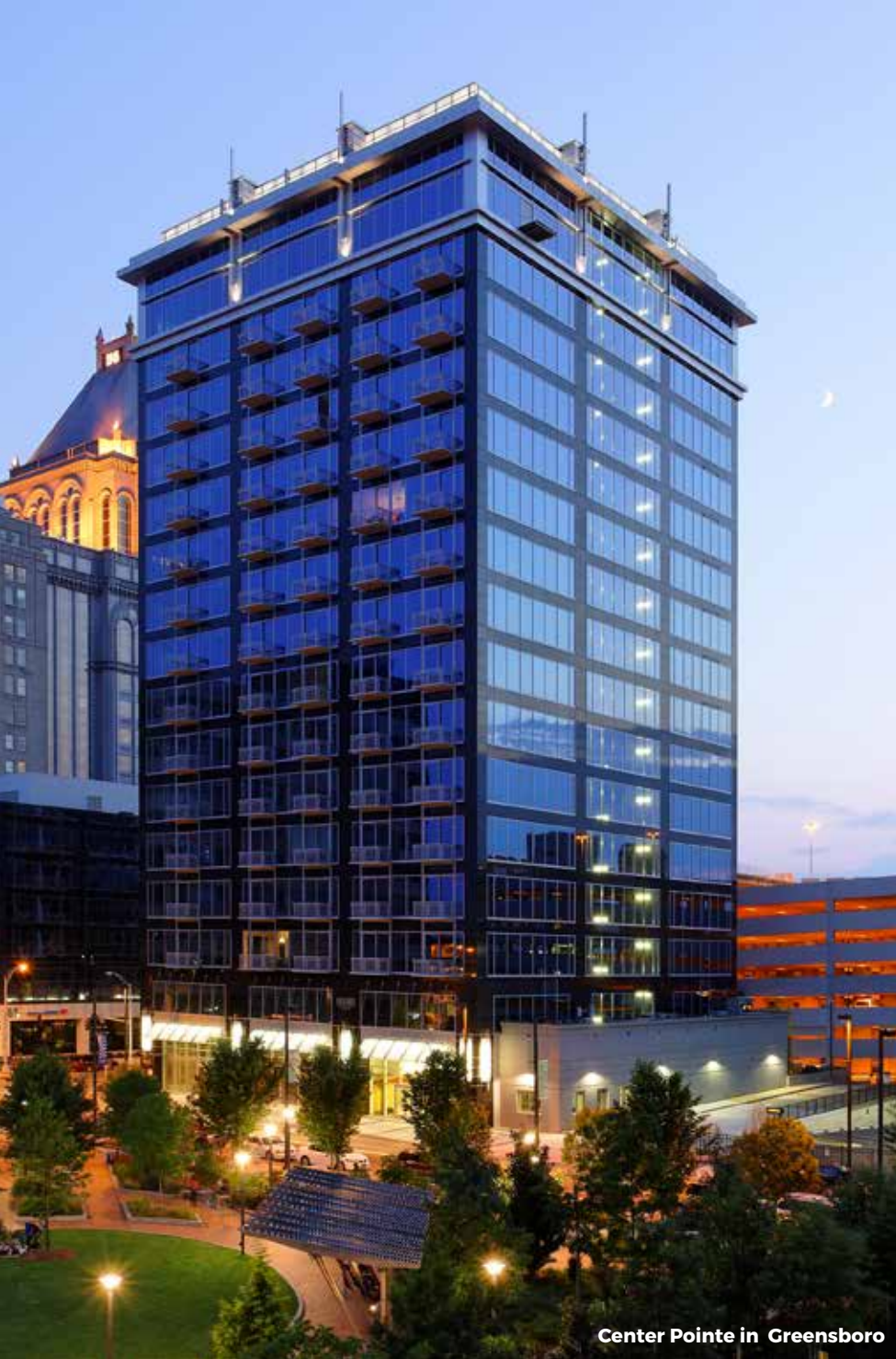
Center Pointe in Greensboro