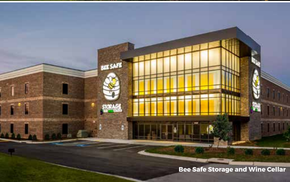
Bee Safe Storage and Wine Cellar

it by making investments in places where others either couldn't have done it or would have shied away."