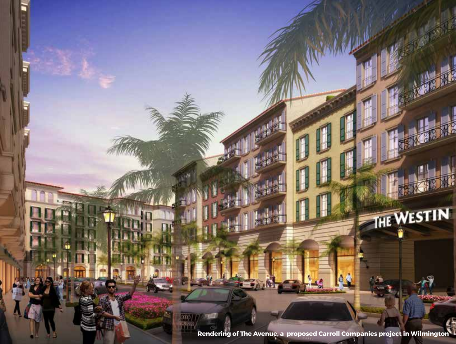
Rendering of The Avenue, a proposed Carroll Companies project in Wilmington

The Avenue, a proposed mixed-use project in Wilmington, will be akin to Palm Beach, Fla.'s upscale Worth Avenue, Carroll says. Plans call for 500 apartments, a hotel, specialty shops and offices.